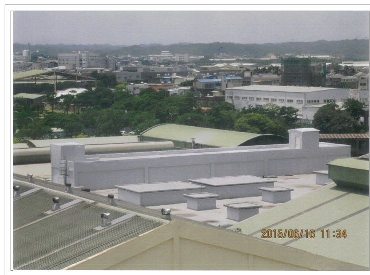
Rooftop Membrane Liner